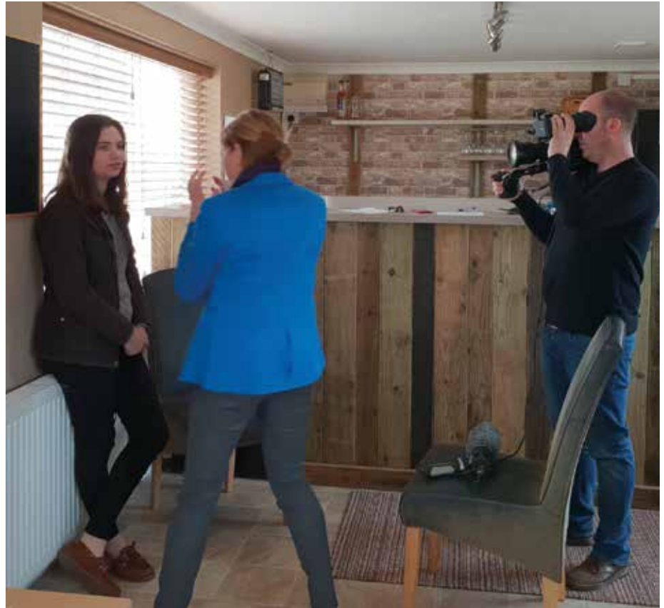
Getting to grips with interview technique