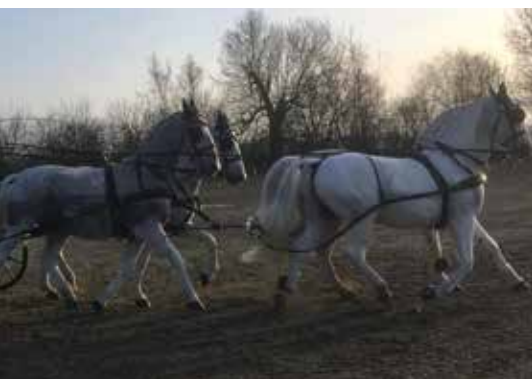
assistance for judges' training

The amount of the training award will depend on the number of applicants. To apply, download the Saddlers' Company Training Grant Prize Form from the web-site. Complete the table in respect of the events you completed and send the form to the BC office by 31st October. No further applications can be received after this date.