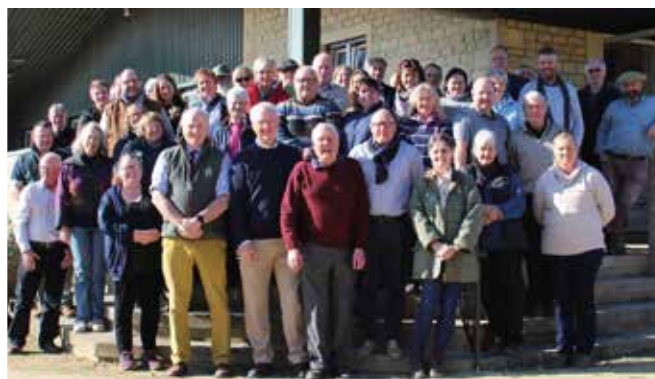
International attendees at the Unicorn Trust